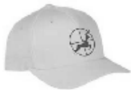
Custom Club Caps