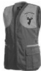
Custom Embroidered Shooting Jackets and vests