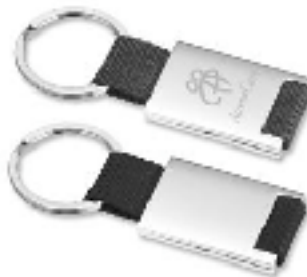
Custom, Key Tags, Rings And Fobs