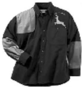
Custom Embroidered Shooting Shirts